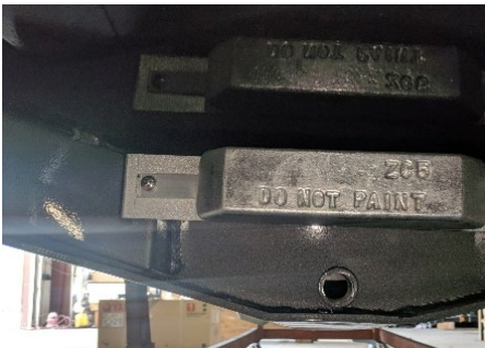
New Sacrificial Anode