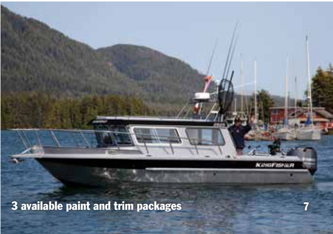
3 available paint and trim packages