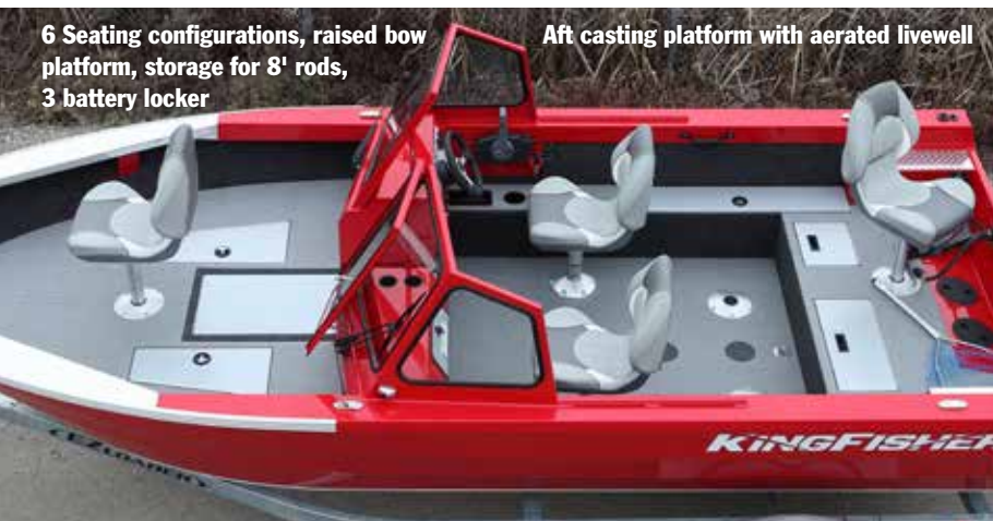
6 Seating configurations, raised bow platform, storage for 8' rods, 3 battery locker