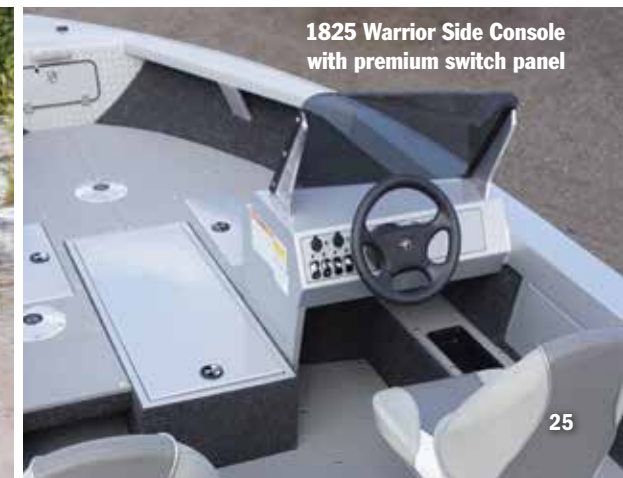
1825 Warrior Side Console with premium switch panel