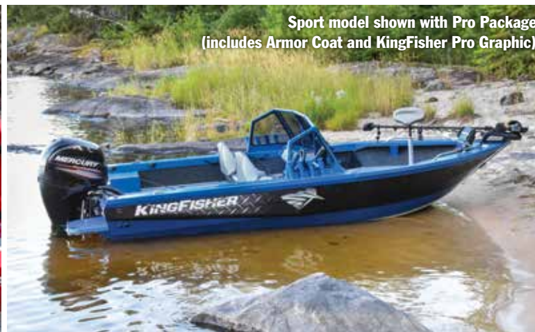
Sport model shown with Pro Package (includes Armor Coat and KingFisher Pro Graphic)