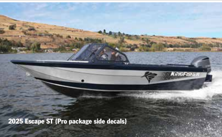
2025 Escape ST (Pro package side decals)