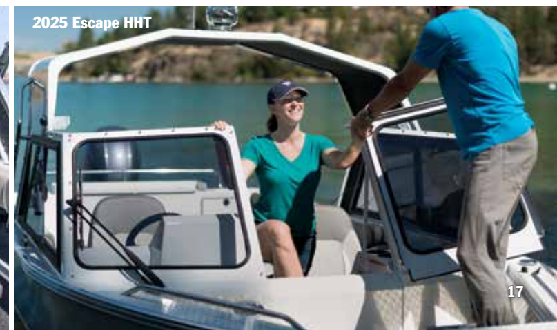
2025 Escape HHT