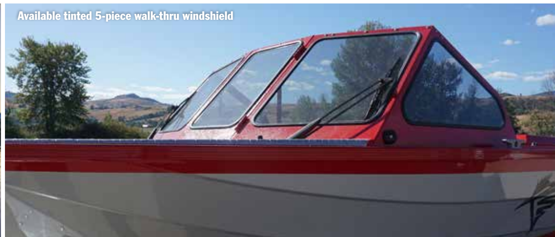
Available tinted 5-piece walk-thru windshield