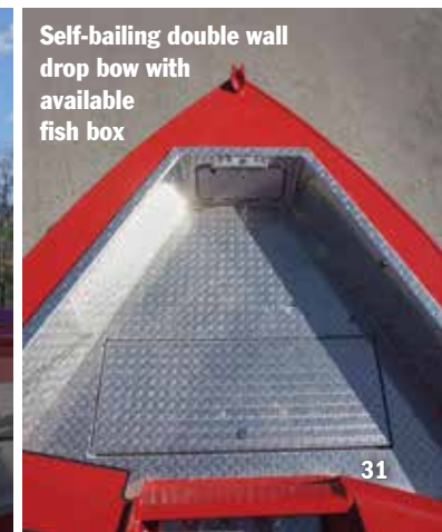
Self-bailing double wall drop bow with available fish box