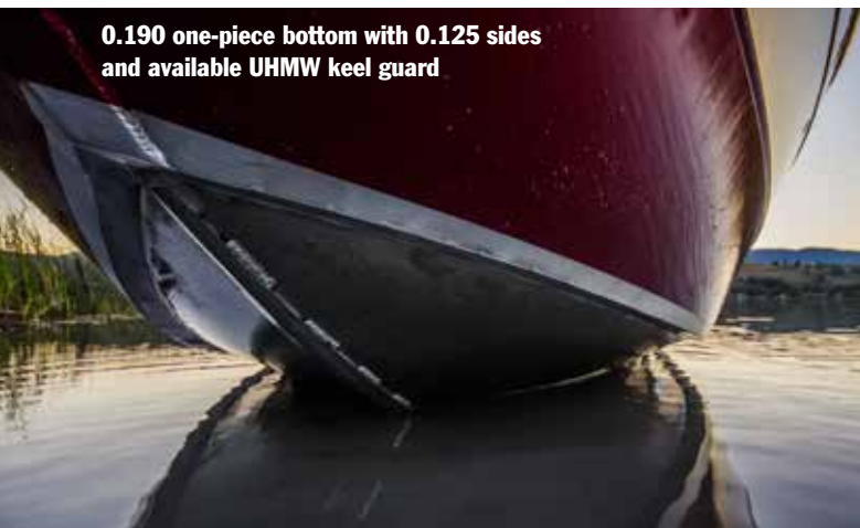
0.190 one-piece bottom with 0.125 sides and available UHMW keel guard