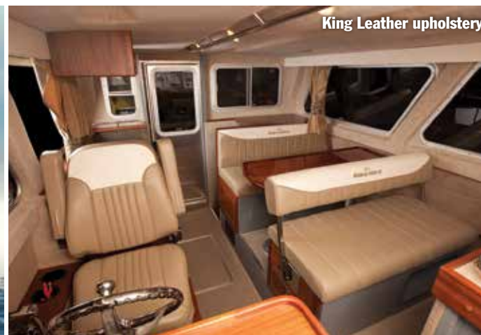
King Leather upholstery