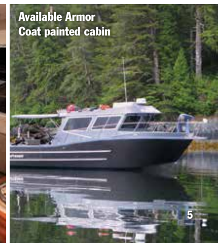
Available Armor Coat painted cabin