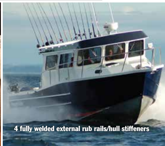
4 fully welded external rub rails/hull stiffeners