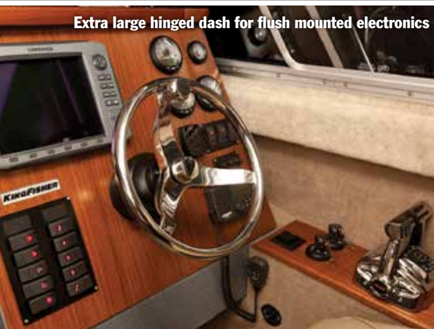
Extra large hinged dash for flush mounted electronics