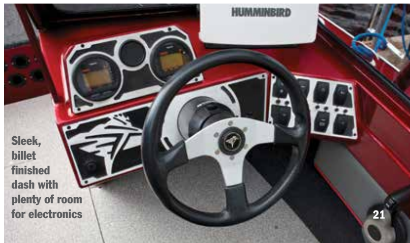
Sleek, billet finished dash with plenty of room for electronics