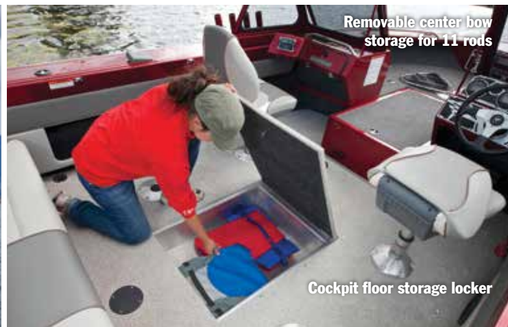
Cockpit floor storage locker