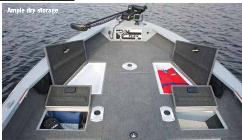
Ample dry storage