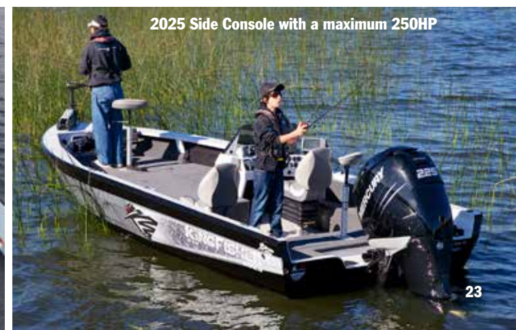
2025 Side Console with a maximum 250HP