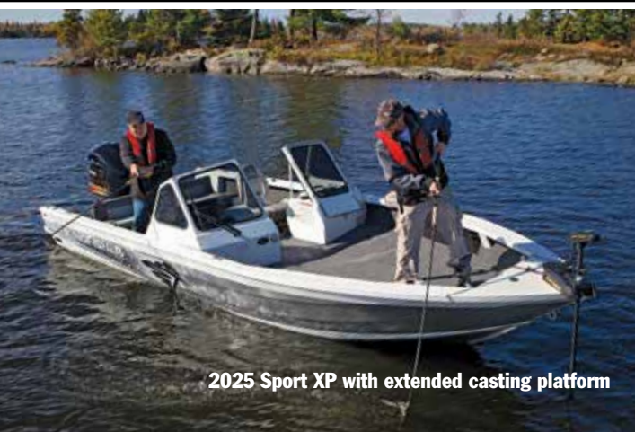
2025 Sport XP with extended casting platform